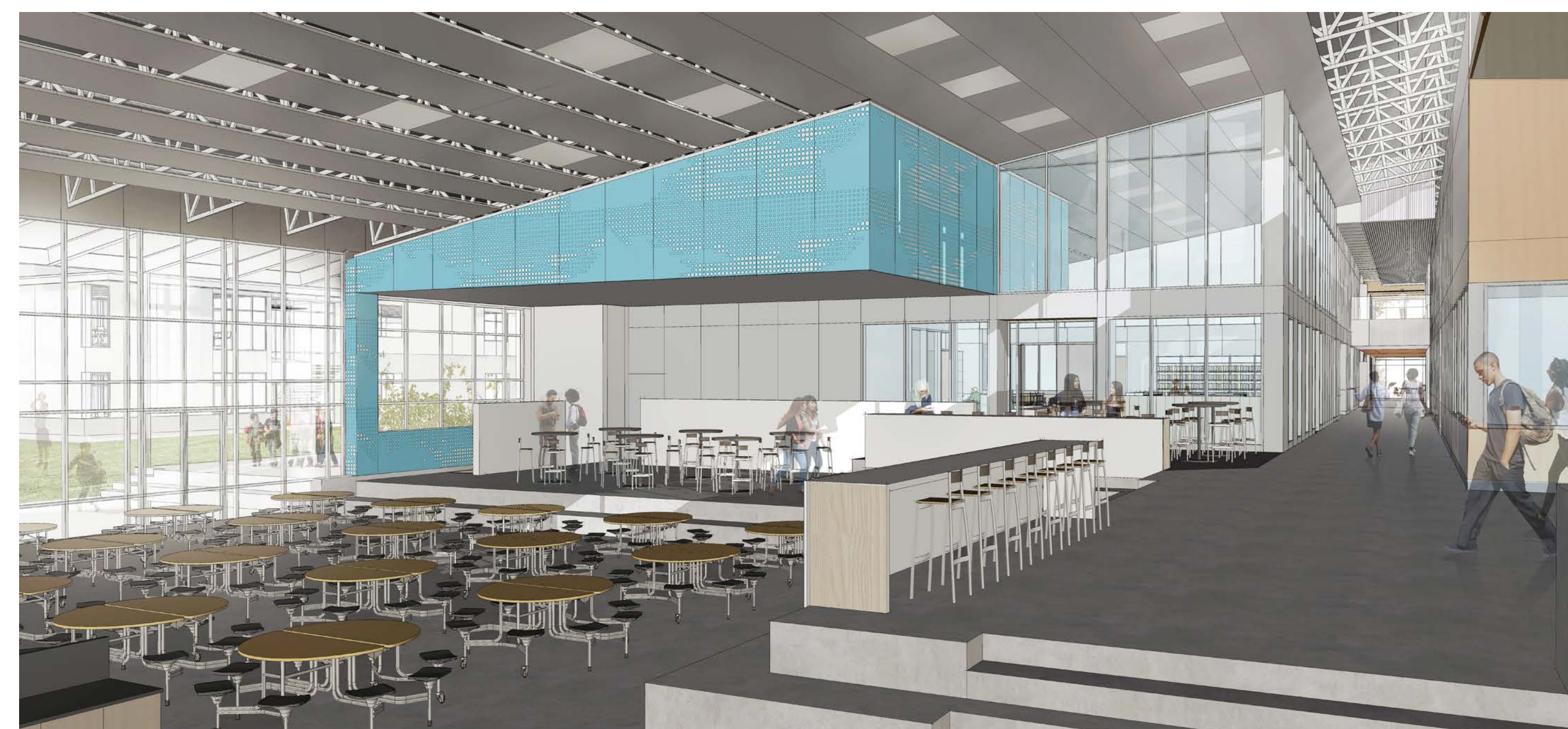
SW VIEW FROM DINING COMMONS