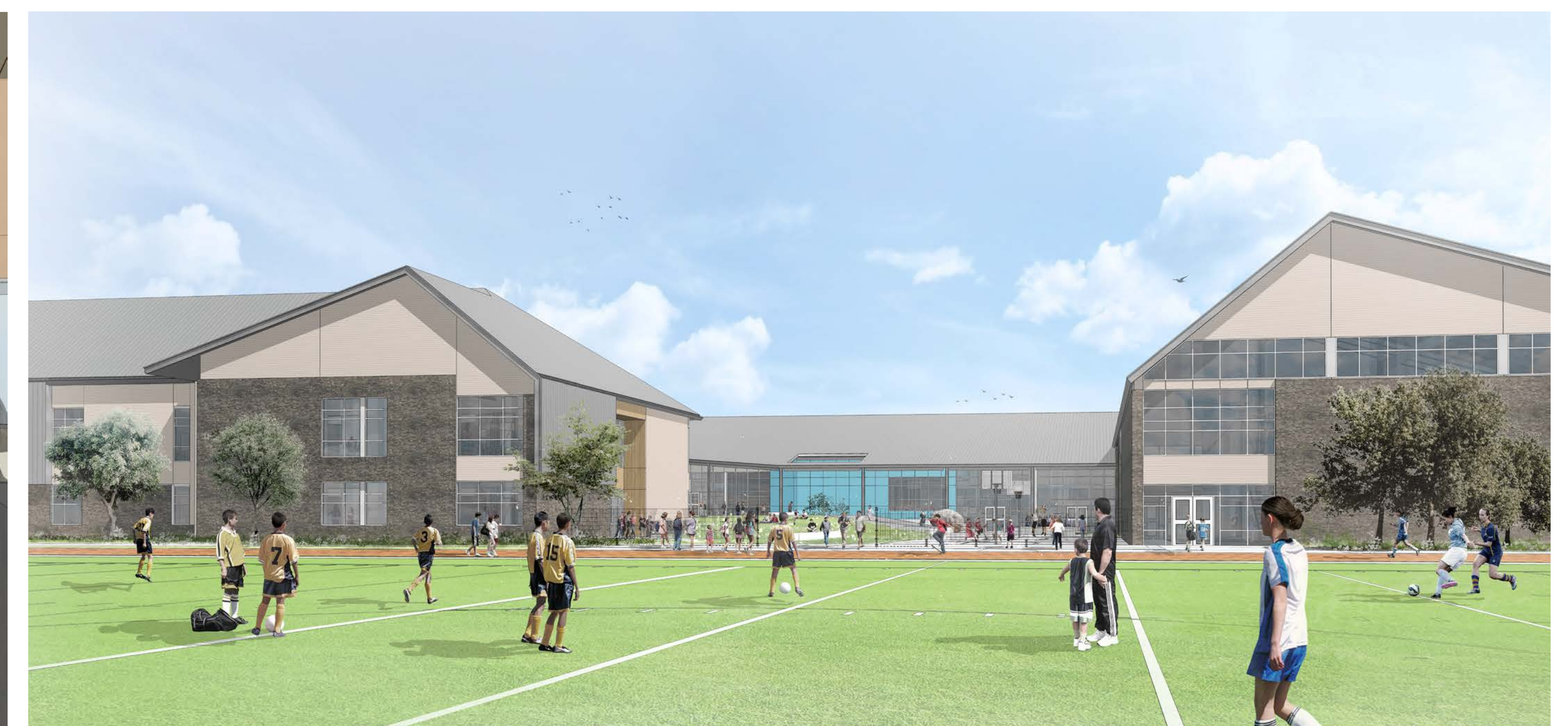
COURTYARD VIEW FROM FIELD